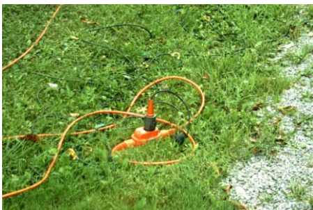
Sercel 408UL Cable system - Indiana Co.

HSE. Arm Geophysics is committed to safety as well as environmental protection and safeguards. ARM has an