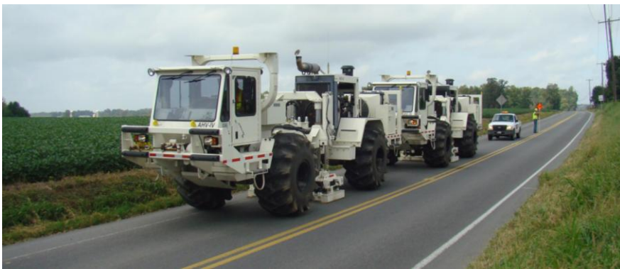
AHV-IV Vibrators at work in Pennsylvania

In the heart of the Marcellus Shale there is a company that has the capabilities to meet your project goals with minimal cost and environmental impact, that company is ARM Geophysics. We have the local experience and capabilities to manage your seismic data acquisition project from survey design to data interpretation.