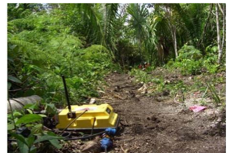
Ascend G5 Wireless – Indiana Co.

excellent safety record working in difficult areas and situations. Safety managers perform job site analysis of each project and develop a custom health and safety plan (HASP) for each area that prescribes the necessary safety guidelines. Safety meetings are held every morning before work starts.